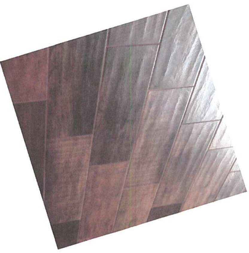
Proposed Tile Replacement

American Olean Woodland Hills Walnut Wood Look